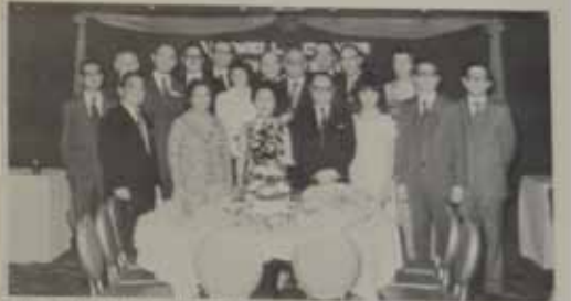
THE W.P.A. EXECUTIVE COMMITTEE AND THE SYMPOSIUM ORGANIZING COMMITTEE