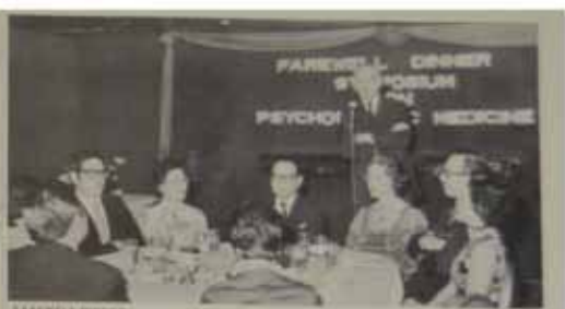
FAMER'S L. CONFER FORUM ON PSYCHO MEDICINE